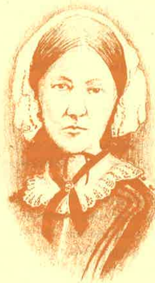
Florence Nightingale 1820 — 1910